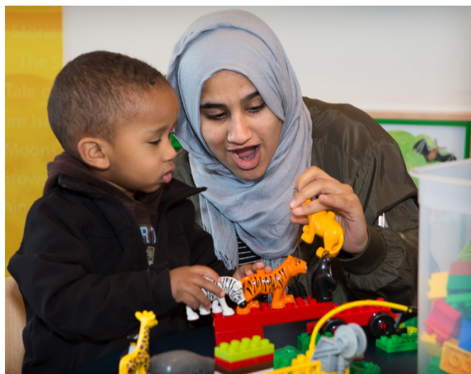
Pictured: A child and caregiver play and learn together at a KCLS library.

Community Creators: This project builds opportunities for people to visibly influence library services and impact their communities. Community Creators aims to amplify community voices through close, responsive, and transparent collaboration with librarian partners. The local librarian team will select one or more ideas, then partner with the creators (aka Community Creators) to bring their ideas to life.