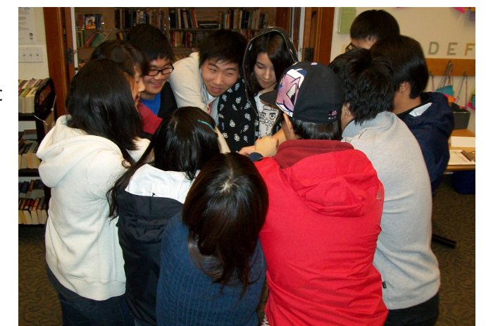
Pictured: A group of teens form a huddle at a KCLS Makerspace.

Data Engineer: This project funds a full-time Data Engineer position for two years who will focus on expansion of the KCLS data warehouse with the goals of: onboarding all KCLS data sources, onboarding relevant external datasets, documenting processes and best practices, testing and validating data, and ensuring the data is available for staff use for reporting and analytics.