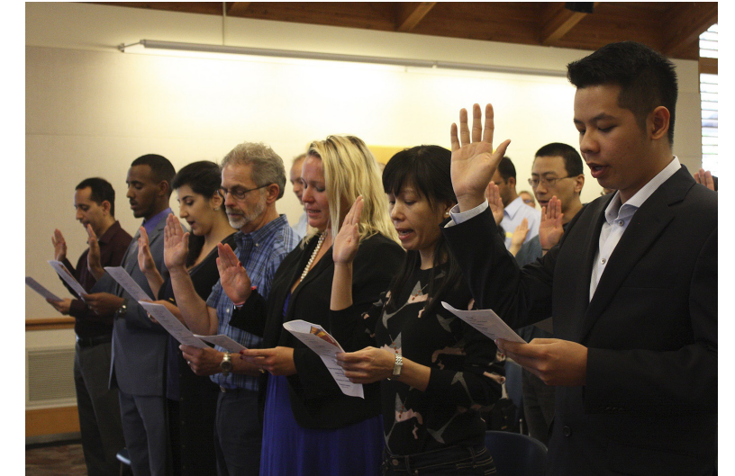
Pictured: A group of individuals who received service from The Welcoming Center are sworn in as American Citizens

Connect: Wi-Fi Hotspots and Laptops: Since 2020, King County Library System has been making connectivity available to people who would not otherwise be able to access the internet. The audience for these laptops and hotspots is partner agencies who serve people who are experiencing housing insecurity, as well as low income seniors, immigrants, refugees, and students.