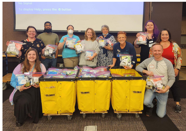
Pictured: A group of volunteers from BECU, Microsoft, and KCLS assemble hygiene kits. These kits will be distributed to individuals experiencing housing instability.

Invest in Yourself - Economic Resilience: The King County Library System is uniquely poised to provide equitable opportunities for economic resilience in our communities. This project supports economic justice in the areas of small business, jobs, personal finance, and the digital skills needed to support all three.