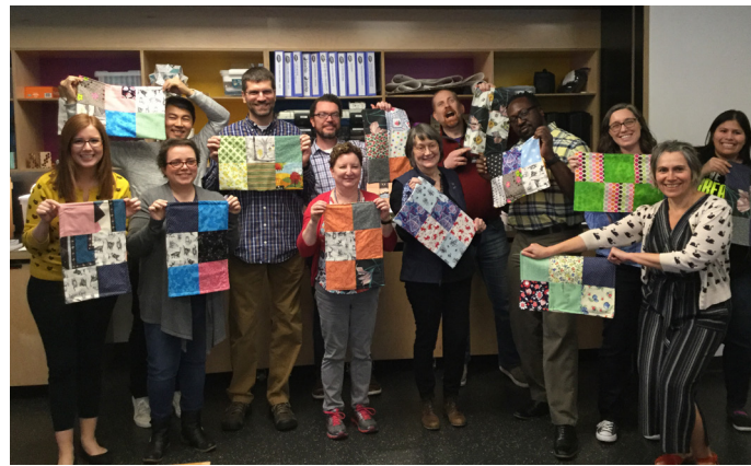
Pictured: A group of teens share the projects they created at a KCLS Makerspace.

Raising A Reader: A nationally recognized caregiver engagement and book delivery program, which is built upon research that shows that children's literacy increases when families are engaged in a regular reading routine and have access to high-interest books that are developmentally appropriate with diverse representation.